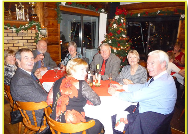
Special thanks to all the ladies in the Social Club for a wonderful dinner and evening.