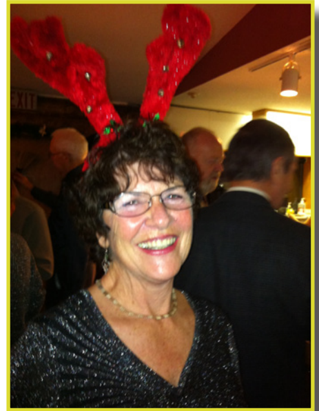
Christmas at the Clubhouse