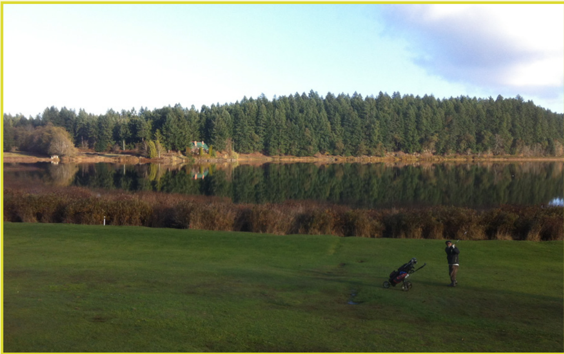
Best ever Winter Golf day